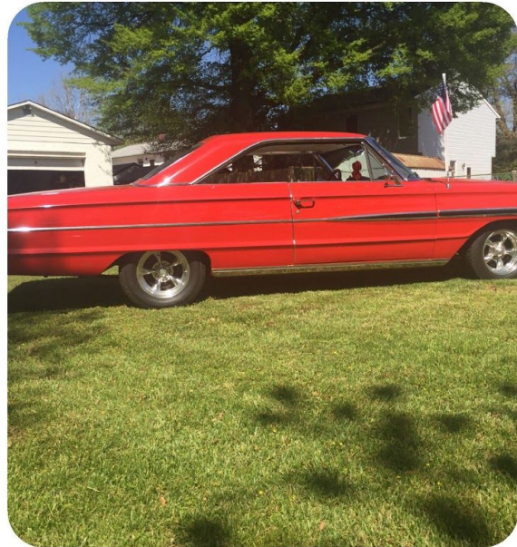
33 Ford Vicky 64 Ford Galaxie 500