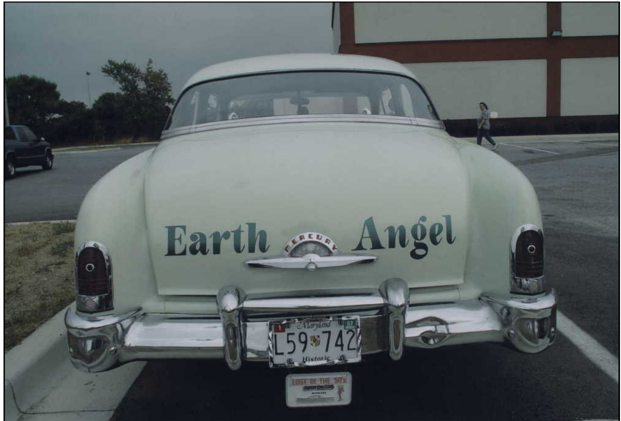
1951 MERCURY "EARTH ANGEL"

My dream was to have a 51 Mercury, but my heart is powered by Chevy. So, we changed the engine and drive line to all Chevy: 350 engine, 350 auto transmission, and a 340 rear end.